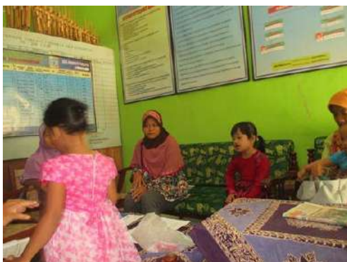
Figure 5. A Down syndrome child was enrolled by her mother at SDN Karangwetan