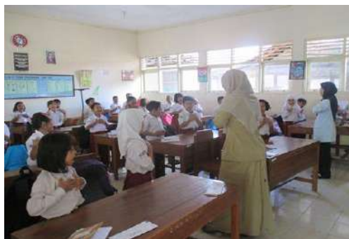
Figure 2. Collaboration of class teachers and GPK in SDN Karangmojo II