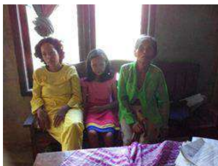
Figure 4. One of the students with special needs of SDN Gedangan I with her family

"... Because in terms of family economy also affect. Because many children are there, sometimes his parents in Jakarta, sometimes his parents continue to work the child just raised by his grandmother here, sometimes their parents have divorced, and others. It causes the child to be slow learner".