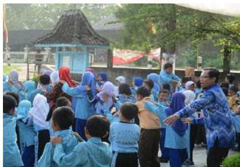
Figure 3. Friday morning activity of principal of SDN Pangkah with the teachers and students