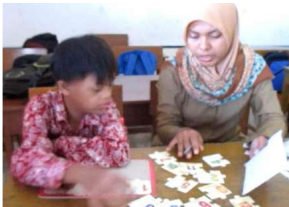
Figure 1. GPK of SD Muhammadiyah Sumberejo providing individualized learning to her students with special needs

even schools that have not received GPK in recent years, such as SDN Gedangan. Of course, this will not be an effective way to handle students with special needs.